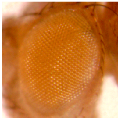
Figure S3 Lack of variegation of mini-white expression from RMCE targets at 53F, 37B, or 38F. Each image represents a fly carrying a single copy of the P[attP.w+.attP] target cassette, which is marked with mini-white . No variegation is evident.